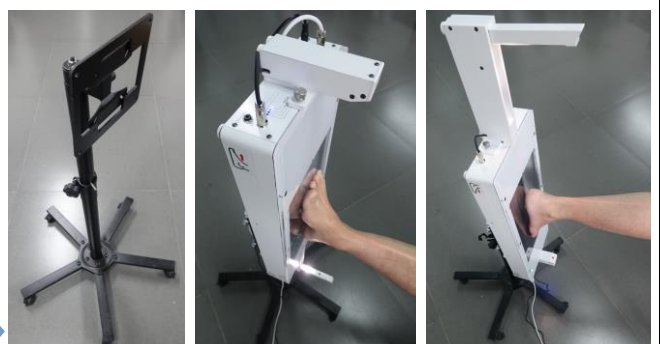
USOL-X Vertical →